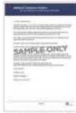
COVID-19 medical clearance notice (Must be shown as a digital pdf or printed copy)