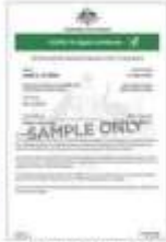
COVID-19 digital certificate (Shown as a printed copy)