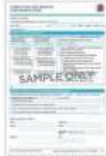
COVID-19 medical exemption form (Shown as a printed copy. Must be signed by a doctor)