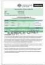
Immunisation history statement (Shown as a printed copy)

You may be fined $1,000 if you don't comply.