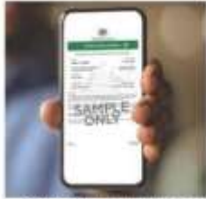
COVID-19 digital certificate (Shown on a Medicare online account through myGov)