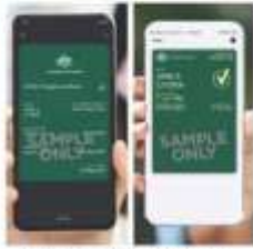
COVID-19 digital certificate (Shown on Android (Google Play) or iOS (App Store))