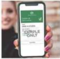
COVID-19 digital certificate (Shown on the Express Plus Medicare app)