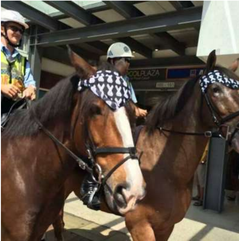
White Ribbon Day for the police horses.