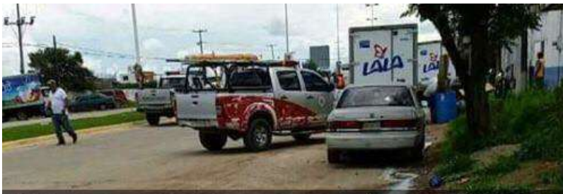
Milk truck crashed, looters showed up moments after