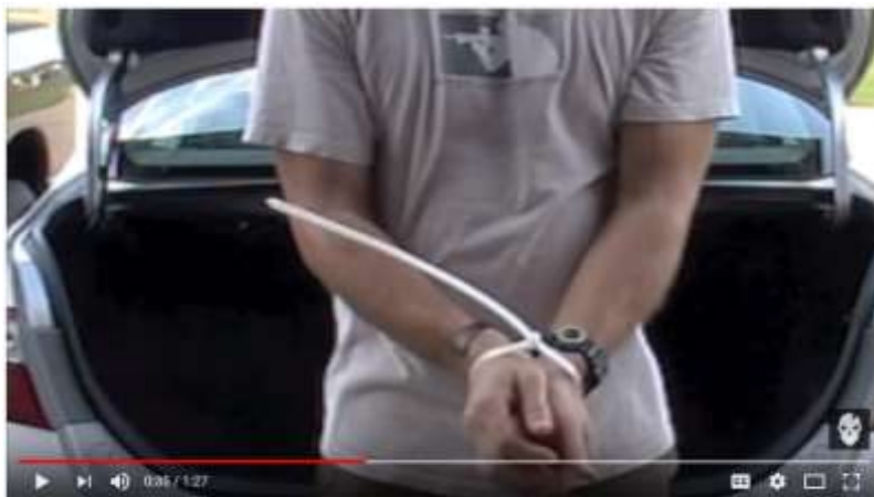
Escaping from Zip Ties